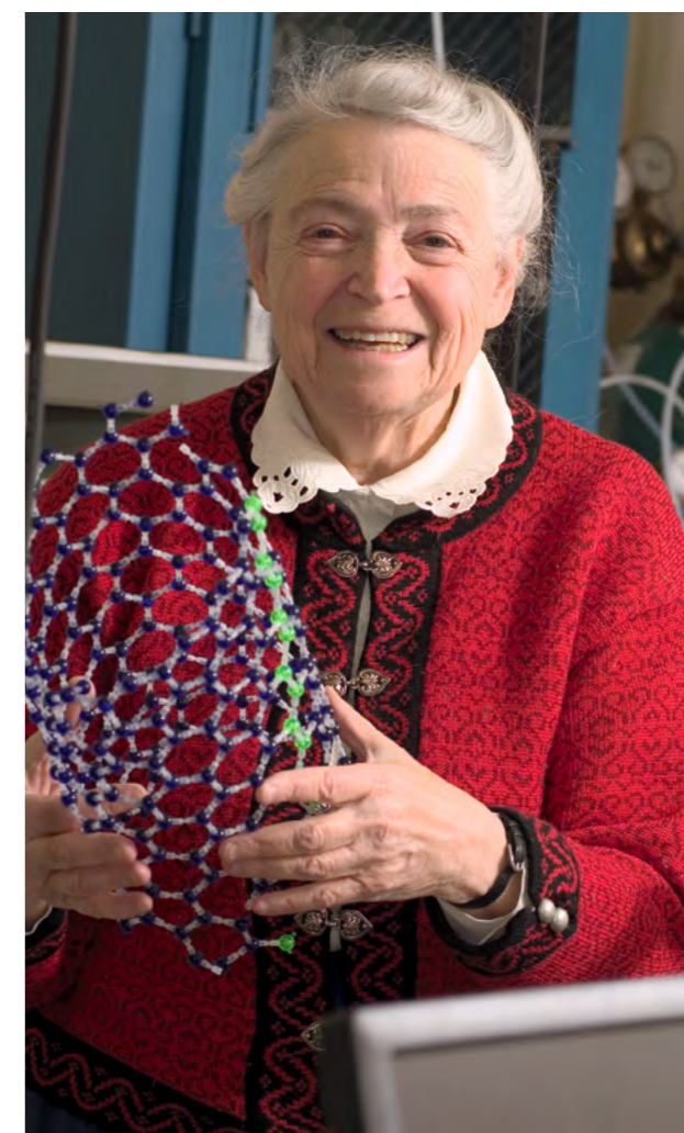
Prof. Mildred Dresselhaus started her career as a faculty member at MIT as the Abby Rockefeller Mauzé Professor in 1967, funded by a female member of the Rockefeller family

When I started my independent career at MIT in the 1960s, women undergraduate students at MIT made up only four percent of the entering class, compared to about 50 percent nowadays. I have for a long time worked hard to increase the participation of women students' careers in physics. Fellowships for women have been and remain helpful in encouraging women to persist in their careers in physics, and I personally have spent much time in running seminars to promote this cause. Women do