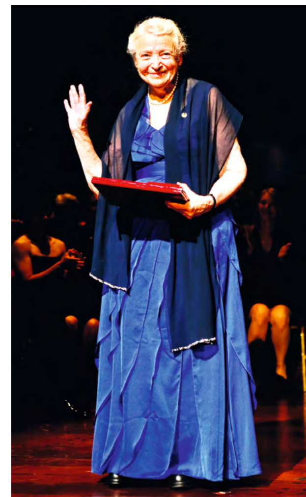
Prof. Mildred Dresselhaus has been awarded 36 honorary doctorates, the Fermi Award, and the Presidential Medal of Freedom – among others

The scientist, who has been called the "Queen of Carbon", has received numerous awards for her research. On top of her scientific success Mildred Dressel-